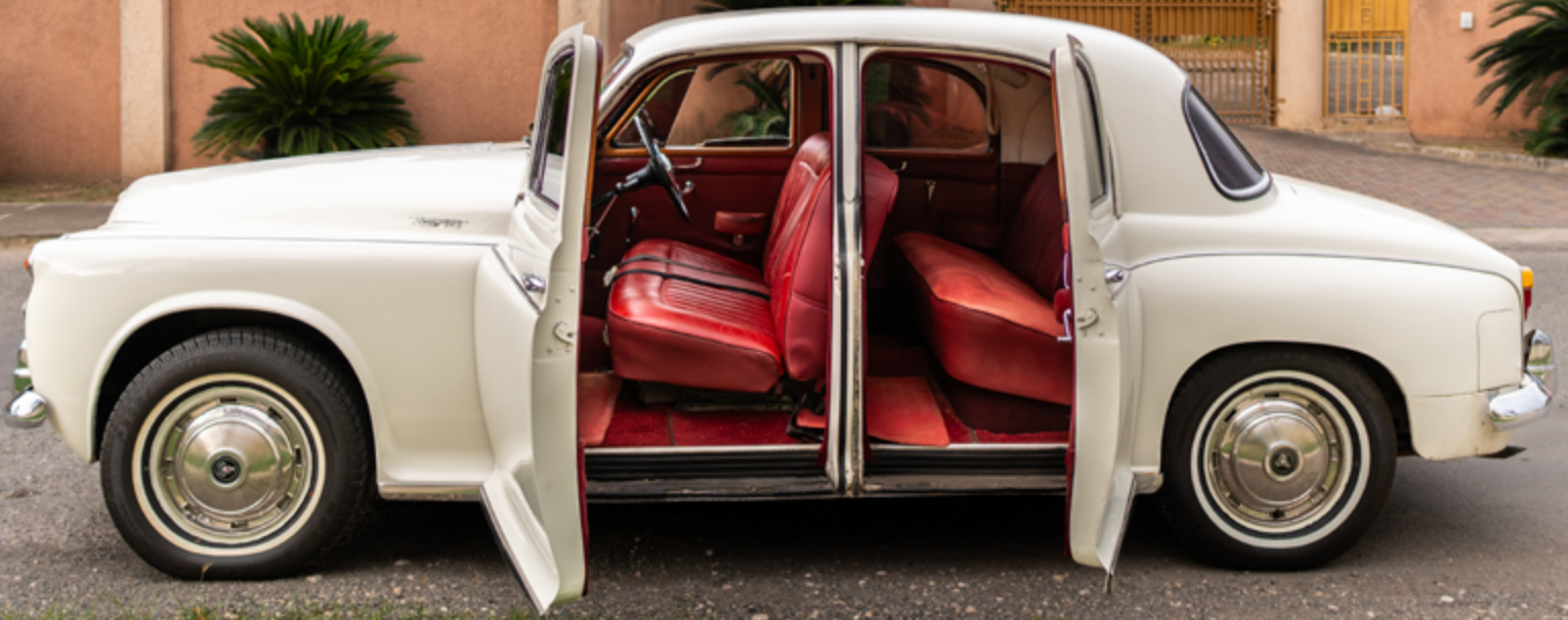
One of the standout features of Brian Madden's 1962 Rover 100 P4 lies in its unique doors, contributing to the car's distinct charm and design.